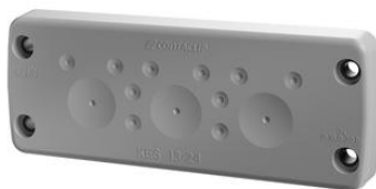
KES 13/24 12x Ø1.2 - 6.3mm 3x Ø7.6 - 20.5mm